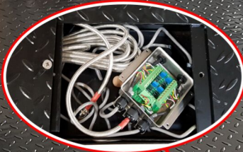
Top mounted Junction box