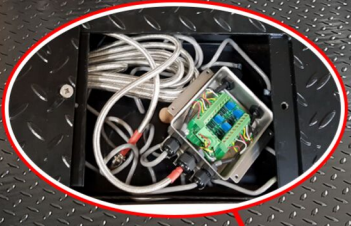
Top mounted Junction box