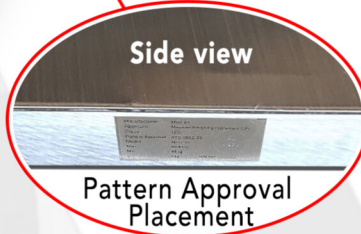
Pattern Approval Placement

NATIONAL METROLOGY INSTITUTE OF MALAYSIA (SIRIM) PATTERN APPROVED