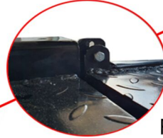
Removeable and foldable ramps